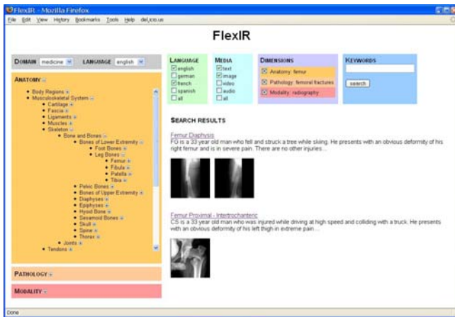
Fig. 1. Dimensions-based search interface of FlexIR

This kind of interface allows flexible ways to access the contents of the underlying collection. For example, from the Human Anatomy dimension, a user can choose to select the Skeleton subcategory, and from this select in turn the Leg Bones subcategory. The user can choose any other dimension, perhaps Pathology and Modality, and from this select the Fracture category, and then group the resulting images by X-ray, MRI, or any other dimension (stage of the pathology, treatment, and so on).